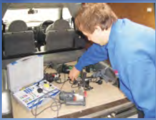
AUTOMATICALLY TESTS... Fuse Test • Carth Bond Insulation Resistance • Leakage Current IN 20 SECONDS

The go-anywhere range of PATs from Transmille can literally save you hours. Firstly, there is no need to waste time locating a mains supply - simply plug in the appliance, clip on the earth bond lead and select CLASS 1 or CLASS 2 test. Secondly, within 20 seconds the entire test sequence is complete - unlike other PATs there is no lengthy setup before you can even begin. Earth bond current is detected from the socket used, and test limits are scaled automatically from the earth bond current and lead length settings. Clear red/green LED indicators make reading the test result easy in any situation. Testing really Is that quick & easy.